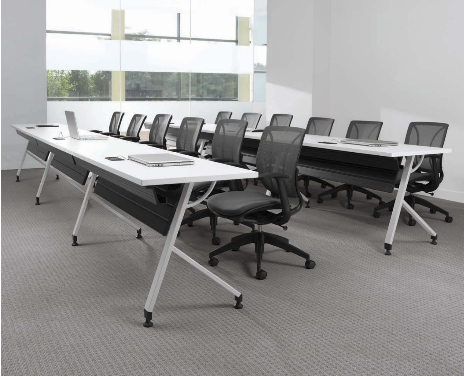
Table top designs