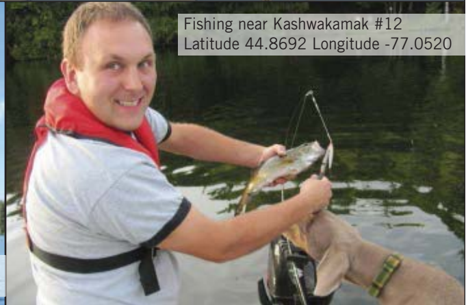
Fishing near Kashwakamak #12 Latitude 44.8692 Longitude -77.0520