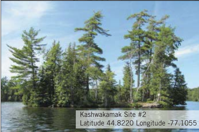
Kashwakamak Site #2 Latitude 44.8220 Longitude -77.1055